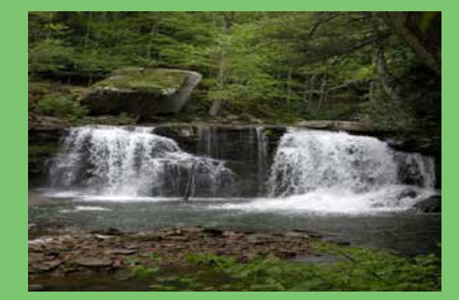
Mill Creek Falls | Prospect, Oregon

Further along highway 138 lie four waterfalls with great viewing areas. Toketee Falls is a two tier waterfall with a 40 foot and 80 foot drop. The